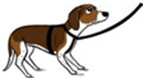
REFUSING TO GO FORWARD