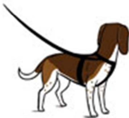
DELIBERATELY IGNORING THE TRIGGER