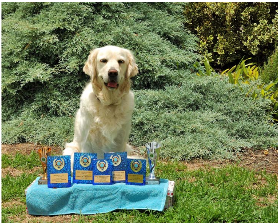
Not a bad year's work!