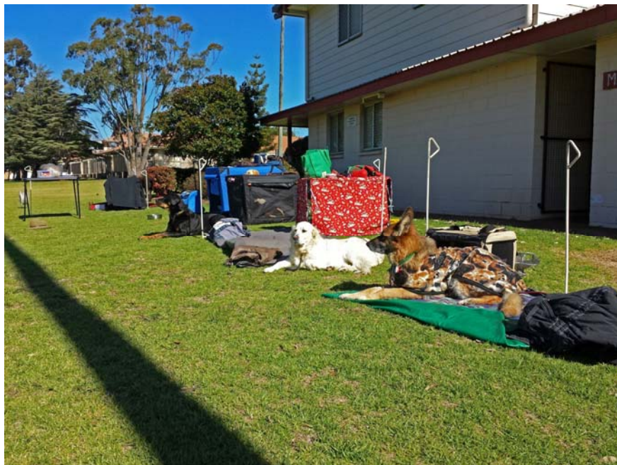
Resting between training sessions