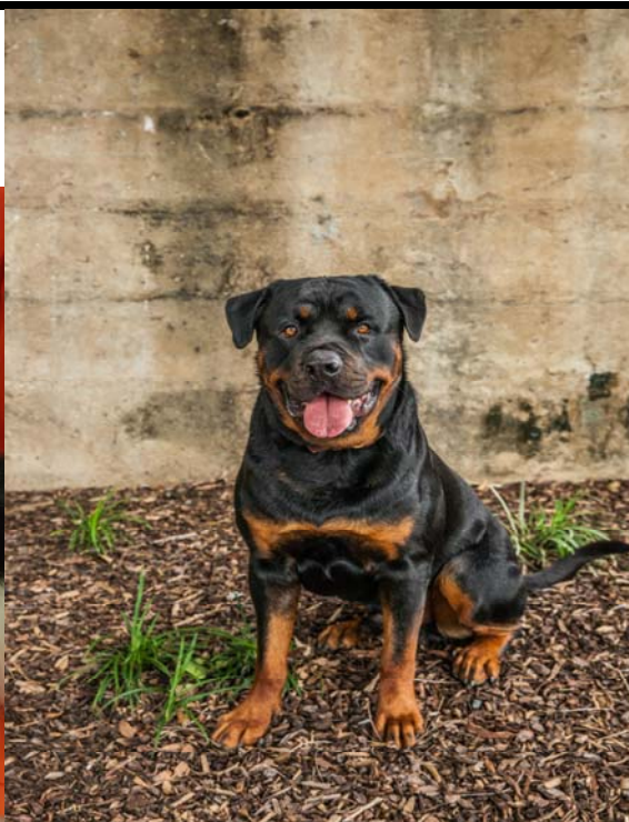
Barney, Max and Abbey the agility dogs